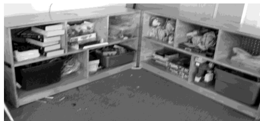
Wood Storage Cabinet - open