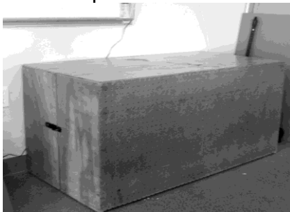
Wood Storage Cabinet - closed