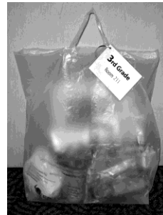
Shared Supply Bag